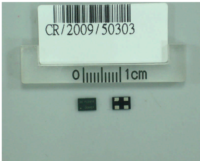
Part Name No.2